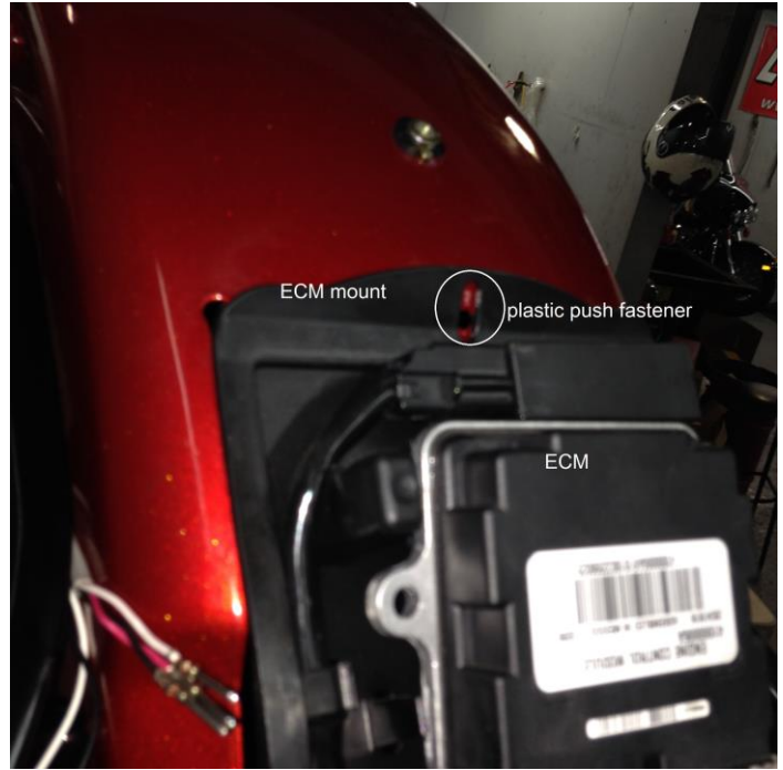
ECM Mount at fender and Push Button Fastener